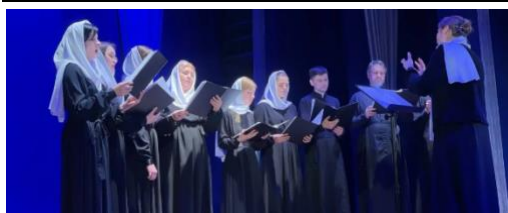
A charity concert in support of the Ukrainian Armed Forces was held in Kmiansky at the Lesya Ukrainka Theater.

Mar. 14th, the Day of the Volunteer in Ukraine, was observed in St. Michael's Golden Domed Cathedral in Kyiv, where Metropolitan Epifani led a prayer service for defenders of the Motherland.