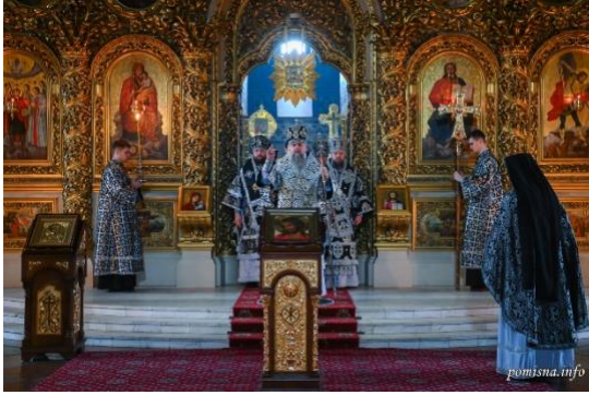
The first Pre-Sanctified Liturgy of Great Lent was celebrated in St. Michael's Golden Domed Cathedral in Kyiv by Metropolitan Epifani